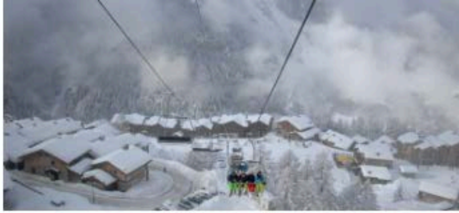
Just hanging around in Sainte Foy