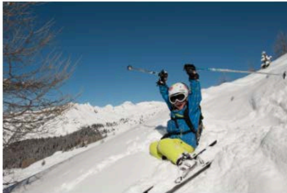
Sainte Foy – Great for the kids!

Small lift system... Big Terrain! At first glance you may think that because there are only 4 lifts in Sainte Foy that the ski area is small, but don't be fooled, great things come in small packages. There are over 35km of pristine pistes, with lots of beginner slopes, blues, reds and black runs and tree-lined tracks. Adventurous powder hunters can venture into the vast expanse of back country and even if you have no previous experience, it's quite easy to book a guide to introduce you to the joys of off-piste. The skiing in Sainte Foy is so legendary, that it's a well known fact that ski instructors from other resorts come to Sainte Foy on their days off!